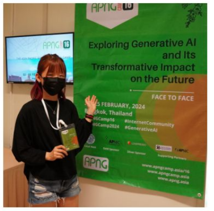
Program Committee Members