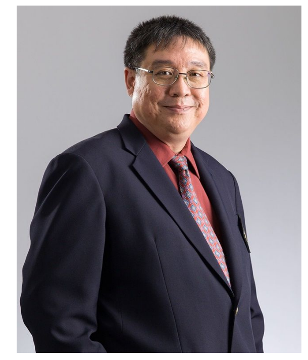
Local Host and Supporting Organizations